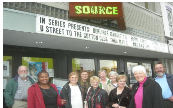
Dupont Circle Villagers at the Source Theater

Dupont Circle Village's first theater outing, a trip to the Source on 14 th Street, was judged a great success by participants. "It was fun," member Dan